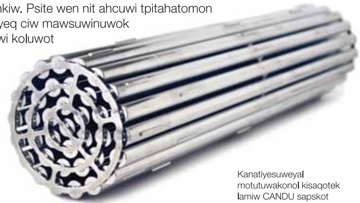
Kanatiyesuweyal motutuwakonol kisaqotek lamiw CANDU sapskot tuciskekon ehphasi mitol naka qocitkikon nisinsk cel nan.

Tahalu te kotokil pihcetu eyikil utenol ewekehtit 'sanaqok motutuwakon, Kanatyesok totoli nikanapasultuwok. 'Totoli tpitahahomuniya tan nit ankeyasu toke naka askomiw. Naka tena wecuwapasultuhtit ipocil nekoma oc ahcuwi ankeyutomuhtit solahkiw. Psite wen nit ahcuwi tpitahatomon weci kisi wolotakhotiyeq ciw mawsuwinuwok naka ktahqomiq. Cuwi koluwot keq ollukhotiyeq.