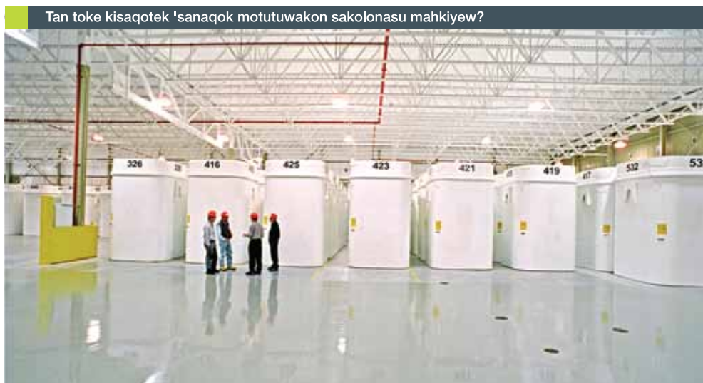
Toke kisaqotek 'sanaqok motutuwakon ote lamiw olonaqeyal paksol eyik Ontario Power Generation's Western Waste Management Facility