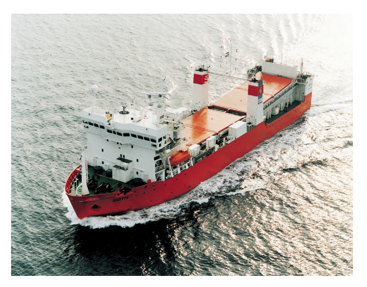
Figure 4: Ship for used fuel transport in Sweden.