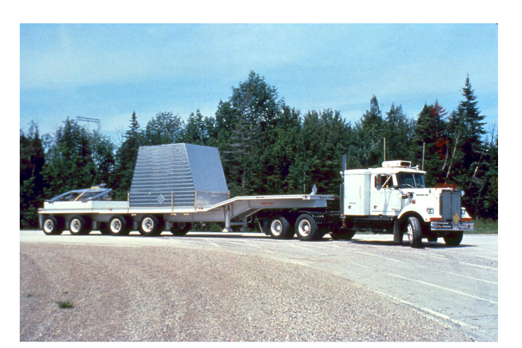
Figure 3: Tractor-trailers for road transport of used fuel: OPG