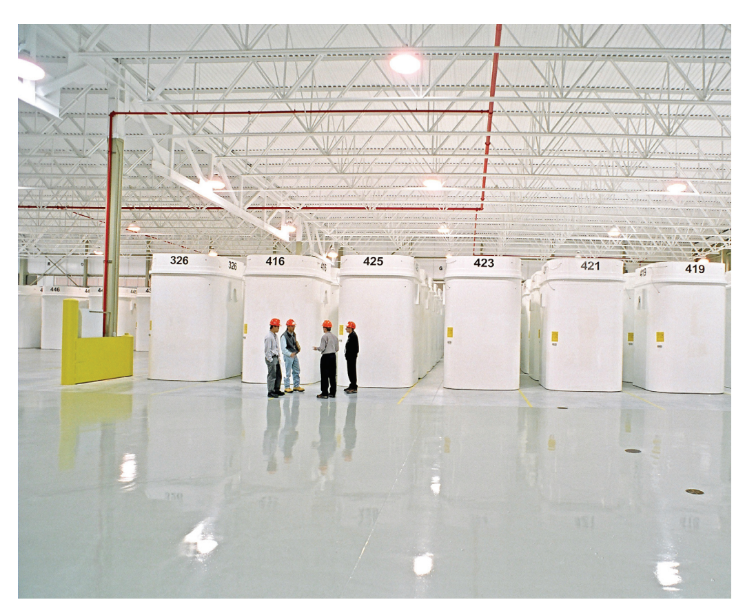
Figure 2: Dry storage casks at OPG's Western Waste Management Facility, Tiverton, Ontario