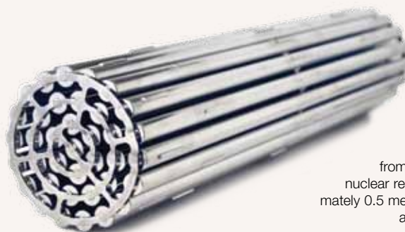
Used fuel bundles from Canada's CANDU nuclear reactors are approximately 0.5 metre long and weigh about 24 kilograms.

A detailed description of Step 2 (Initial Screening) and Step 3 (Preliminary Assessment) is provided in the Appendix to this document.