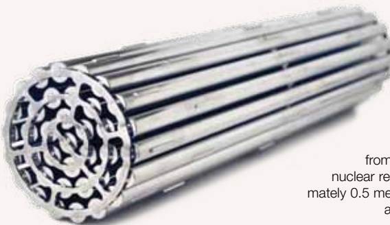
Used fuel bundles from Canada's CANDU nuclear reactors are approximately 0.5 metre long and weigh about 24 kilograms.

A detailed description of Step 2 (Initial Screening) and Step 3 (Preliminary Assessment) is provided in the Appendix to this document.