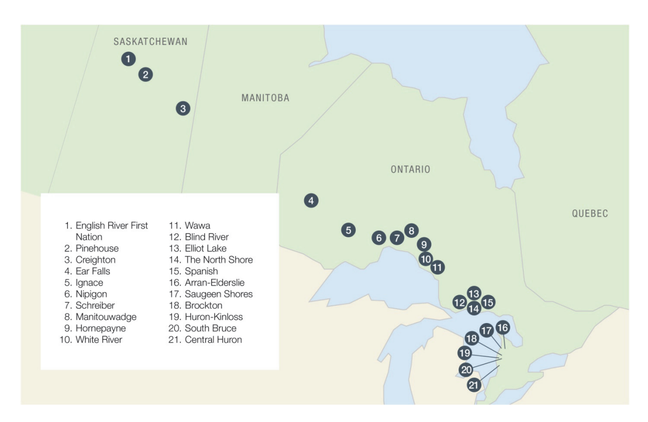
Figure 1: Communities that Requested Preliminary Assessments in the Site Selection Process

Figure 1 maps the locations of the 21 communities in Saskatchewan and Ontario that requested Preliminary Assessments. These two provinces, along with Quebec and New Brunswick, are involved in the nuclear fuel cycle. Saskatchewan is involved through the mining of uranium, which is used in the fabrication of nuclear fuel. Ontario, Quebec and New Brunswick are involved through the production of electricity using nuclear power plants.