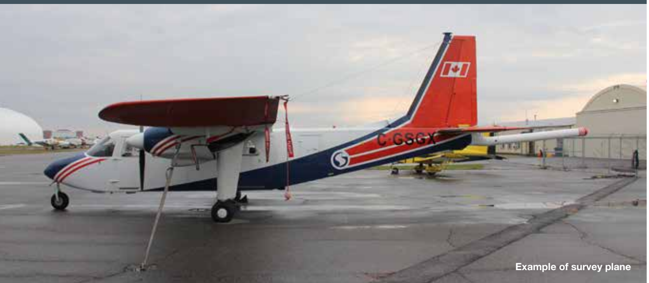
Example of survey plane

The project will only proceed with the interested community, First Nation and Métis communities, and other surrounding communities in the area working in partnership.