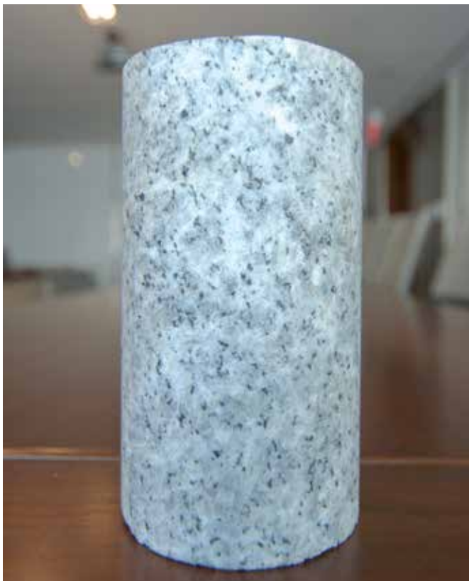
Example of core