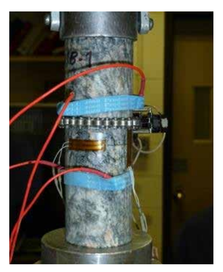
Example of geomechanical testing

As field studies progress, the NWMO will work with people in the area to share information and build awareness and understanding.