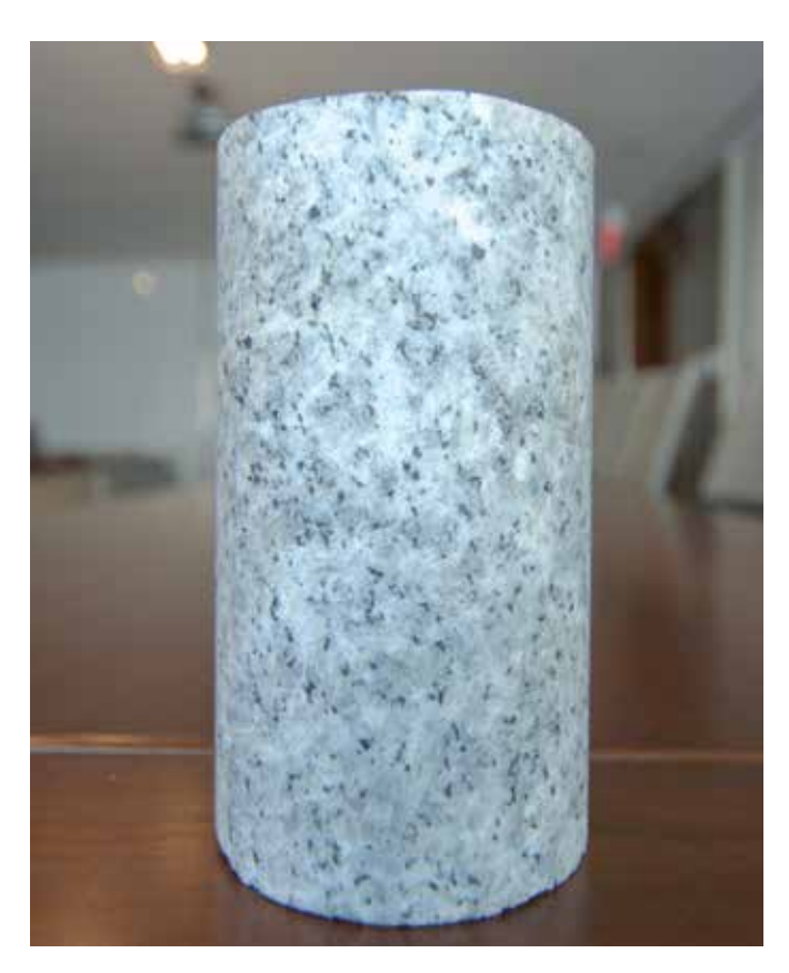
Example of core