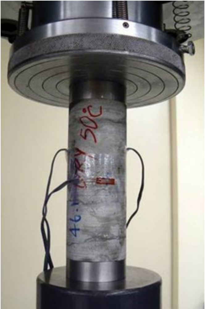
Example of geomechanical testing

As field studies progress, the NWMO will work with community members to share information and build awareness and understanding.