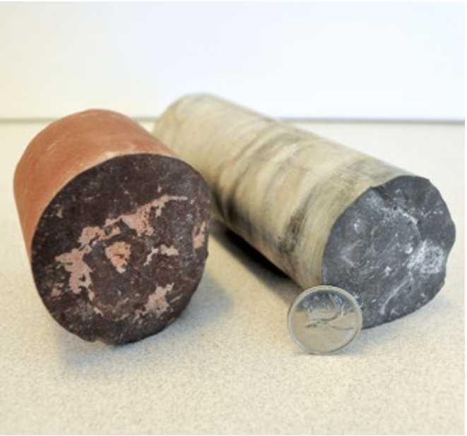
Examples of core

A borehole is a narrow, deep, circular hole made in the ground using motorized equipment (drilling equipment). The process involves drilling the borehole and retrieving cylinder-shaped rock samples, called core. A wide range of testing is performed on samples of the core and in the borehole to investigate properties of the rock.