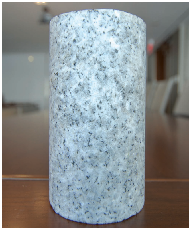
Example of core