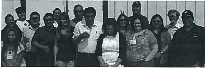
Participants at Nigigoon- siminikaaning First Nation meeting.