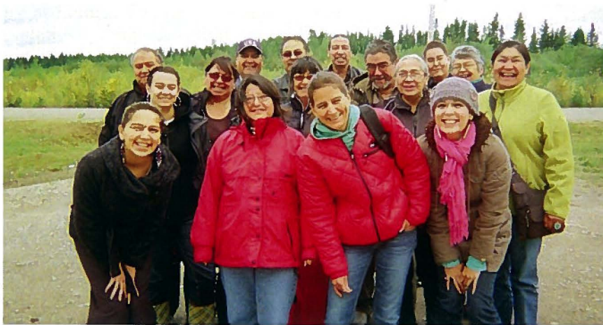
COO Team with discussion participants in Moose Factory

Chiefs in Ontario 111 Peter Street, Suite 804 Toronto, Ontario M5V 2H1 416-597-1266