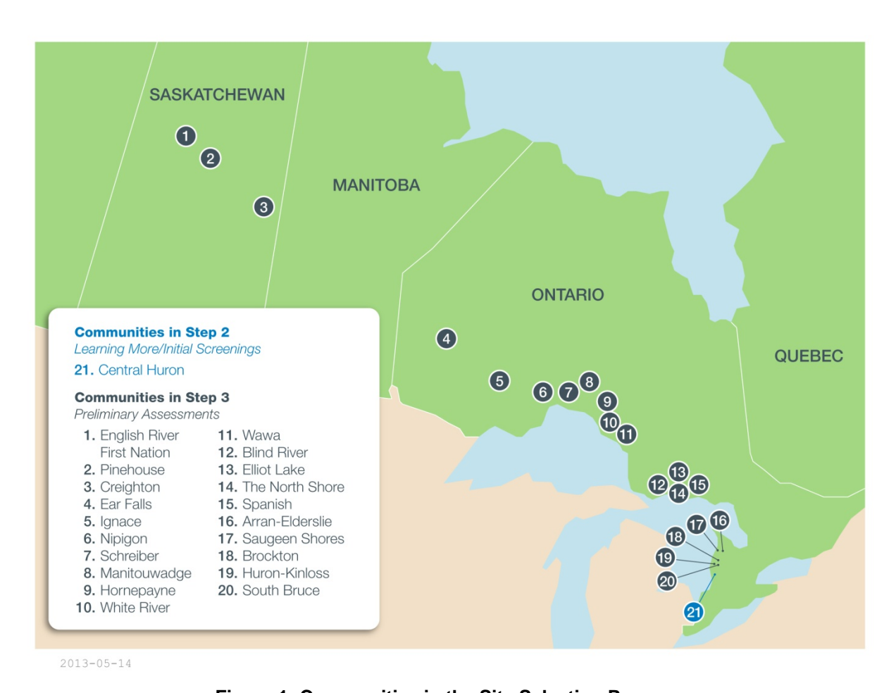
Figure 1: Communities in the Site Selection Process

Figure 1 maps the locations of the 21 communities in Saskatchewan and Ontario that have been actively engaged in the site selection process (20 are in Step 3; one is in Step 2). These two provinces, along with Quebec and New Brunswick, are involved in the nuclear fuel cycle. Saskatchewan is involved through the mining of uranium, which is used in the fabrication of nuclear fuel. Ontario, Quebec and New Brunswick are involved through the production of electricity using nuclear power plants.