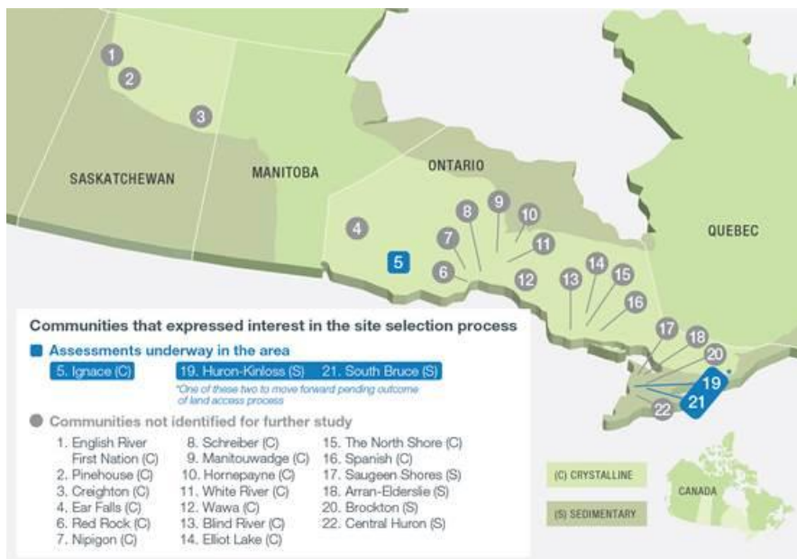
Figure 1 Communities Continuing in the Site Selection Process for the APM Project as of December 2019

In late 2018, the Nuclear Waste Management Organisation (NWMO) created the Adaptive Phased Management Environment Review Group (the ERG). The NWMO is charged with implementing Canada's plan for the long-term management of used nuclear fuel, the Adaptive Phased Management (APM) project. This entails a deep geologic repository in suitable geology located in an informed and willing host community in partnership with that community's Indigenous and municipal neighbours. The NWMO invited communities interested in learning more about potentially hosting the APM project and received 22 expressions of interest. Through a process of technical, socio-economic and cultural studies, this list of possible siting areas has been reduced to three by the end of 2019, shown in Figure 1. It will be further reduced to one preferred site and an impact assessment under the Impact Assessment Act of Canada will be required to construct and operate the facility. For these reasons, the ERG was established to provide independent expert advice and guidance on environmental programs and impact assessment planning. Brief biographies of the ERG members are provided at the end of this report.