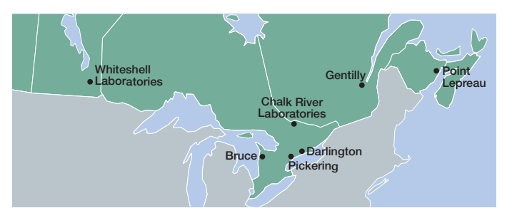
Figure 1: Current storage locations of used fuel

Used nuclear fuel is currently safely stored at nuclear power reactor sites and nuclear research sites in Ontario, Québec, New Brunswick and Manitoba (Figure 1). Small amounts of fuel are also present inside university research reactors in Alberta, Saskatchewan, Ontario, Québec and Nova Scotia.