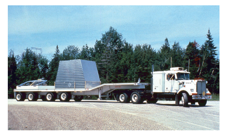
Figure 3: Tractor-trailers for road transport of used fuel