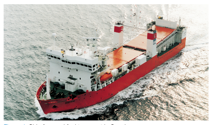
Figure 4: Ship for used fuel transport in Sweden