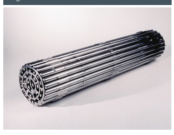
Figure 3 CANDU Fuel Bundle

Proceed with the collaborative design of a process for site selection.