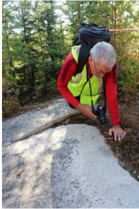
Figure 2. GRG members and two colleagues from NWMO examining initial borehole site 1 (to the left) and an outcrop along a prominent surface lineament (to the right) in the Ignace area.

following the discussions during the visit. Besides some general observations, the feedback included considerations relating to scheduling of site selection fieldwork, work packages for this program (see also Section 5.6), data reporting and integration including forthcoming 3D geosphere modelling.