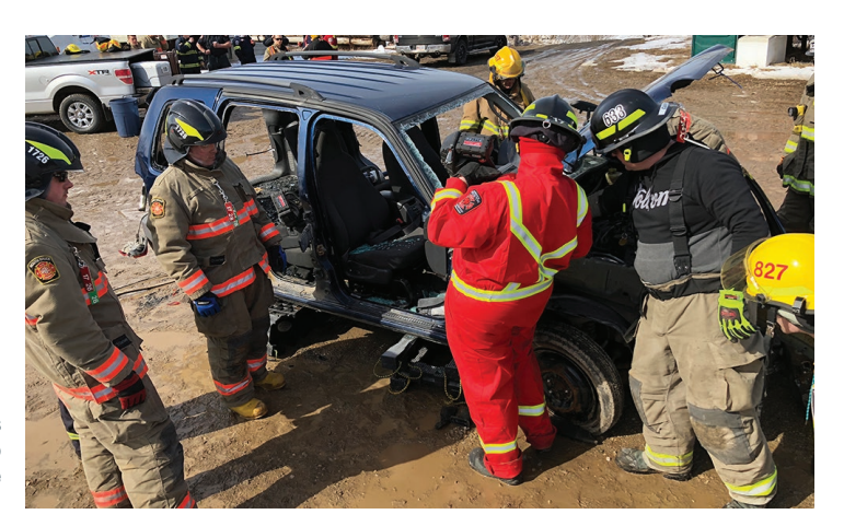
Local firefighters take part in a mock auto extrication exercise at the Bruce County Fire School.

Many want information on how the NWMO will plan for emergencies along transportation routes, especially regarding communication with local authorities and emergency response personnel. Radiation risks to first responders during the unlikely event of a breach of the UFTP are top of mind, and people often probe to better understand the hazard and how it might be practically managed during a variety of hypothetical scenarios. People are starting to ask about specific accident scenarios, wanting to understand how the NWMO will consider those scenarios in our transportation planning.