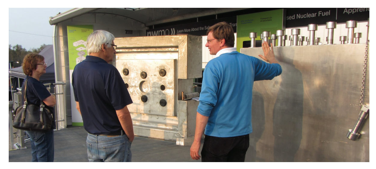
NWMO staff talks about transportation with attendants at the Dryden Fall Fair.

Based on what we are hearing, we can consider a number of emergent thematic touch points in the course of engagement going forward. These themes, and the work to address them, begin to chart a path to collaboratively planning and implementing a safe and socially acceptable transportation plan.