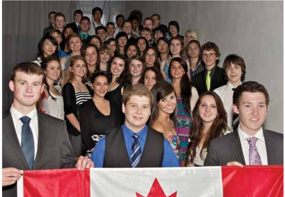
Team Canada participated in the 13 th edition of the MILSET Expo-Sciences International held from July 18 to July 23, 2011.

Team Canada won 10 awards at MILSET for a series of excellent science projects.