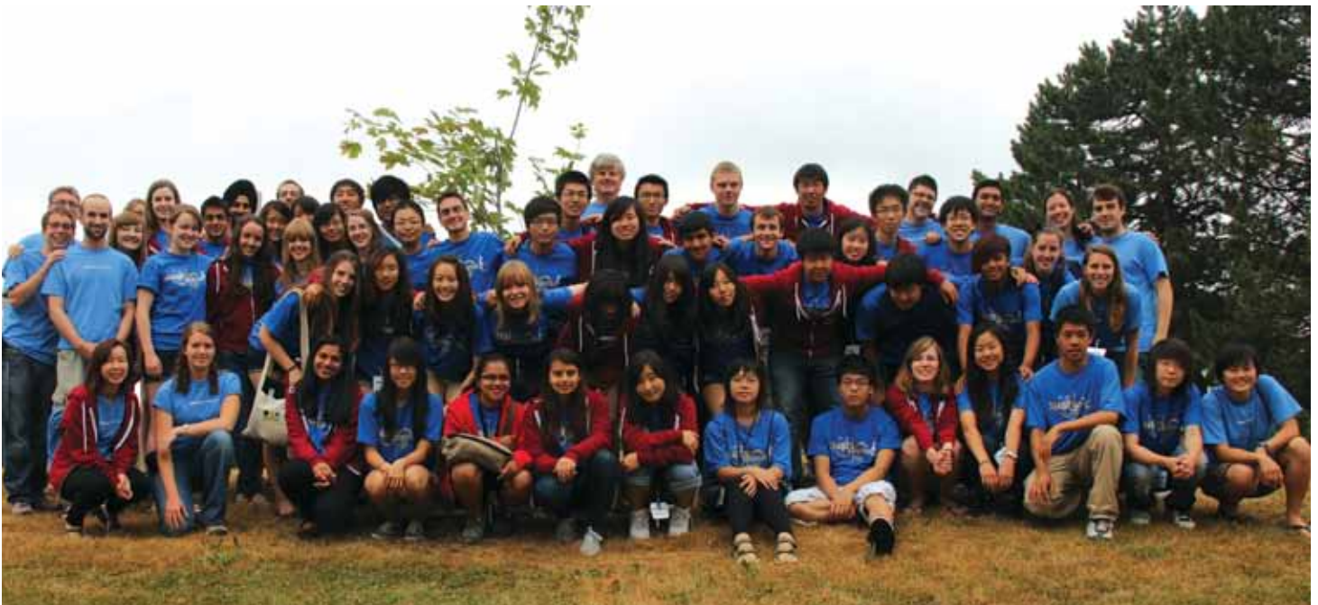
Students at the 2011 University of Waterloo Shad Valley campus, part of more than 500 students who participated in the summer program at 10 Canadian host universities from July 3 to July 29.

visits and makes presentations at several Shad Valley campuses each year. In 2011, the NWMO visited four campuses (University of Waterloo, McMaster University, Carleton University and Lakehead University) and gave presentations on the long-term management of Canada’s used nuclear fuel.