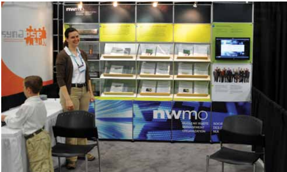
NWMO booth at the 50 th Canada-Wide Science Fair held in Toronto, Ontario, from May 14 to May 21, 2011.

In addition, the NWMO participated in the 2011 Canada-Wide Science Fair organized by Youth Science Canada.