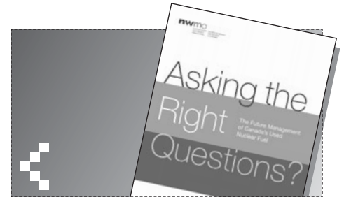
Discussion Document 1

A primary purpose of the discussion document is to invite comment on how the NWMO proposes to assess long-term nuclear waste