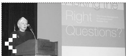
Challenge: Canadian Nuclear Association