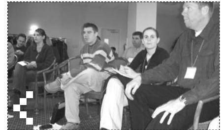
Sudbury: National Citizen's Dialogue