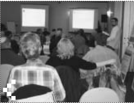
Information & Discussion Timmins, Ontario

Almost 900 Canadians participated when NWMO staff and Assessment Team members fanned out from coast to coast over the winter convening 121 information and discussion sessions in 34 communities in every province and territory of the country. The interested citizens were asked about the strengths and lim-